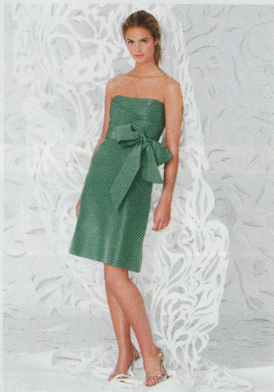
From the Lela Rose collection: A cocktail-length strapless silk taffeta bridesmaid dress.

Anyone who's seen 27 Dresses knows that bridesmaids' attire can be rather unique. But The Dessy Group is offering a new line that your bridesmaids can likely wear again and again. They've tapped Lela Rose — the Texas-born designer whose creations have been worn by Jessica Simpson and Selma Blair, among others — to create modern bridesmaids dresses. Rose's designs combine exquisite elements from her signature collection, such as layered crinkle chiffon and pleated cotton faille. To find a local retailer, visit dessy.com .